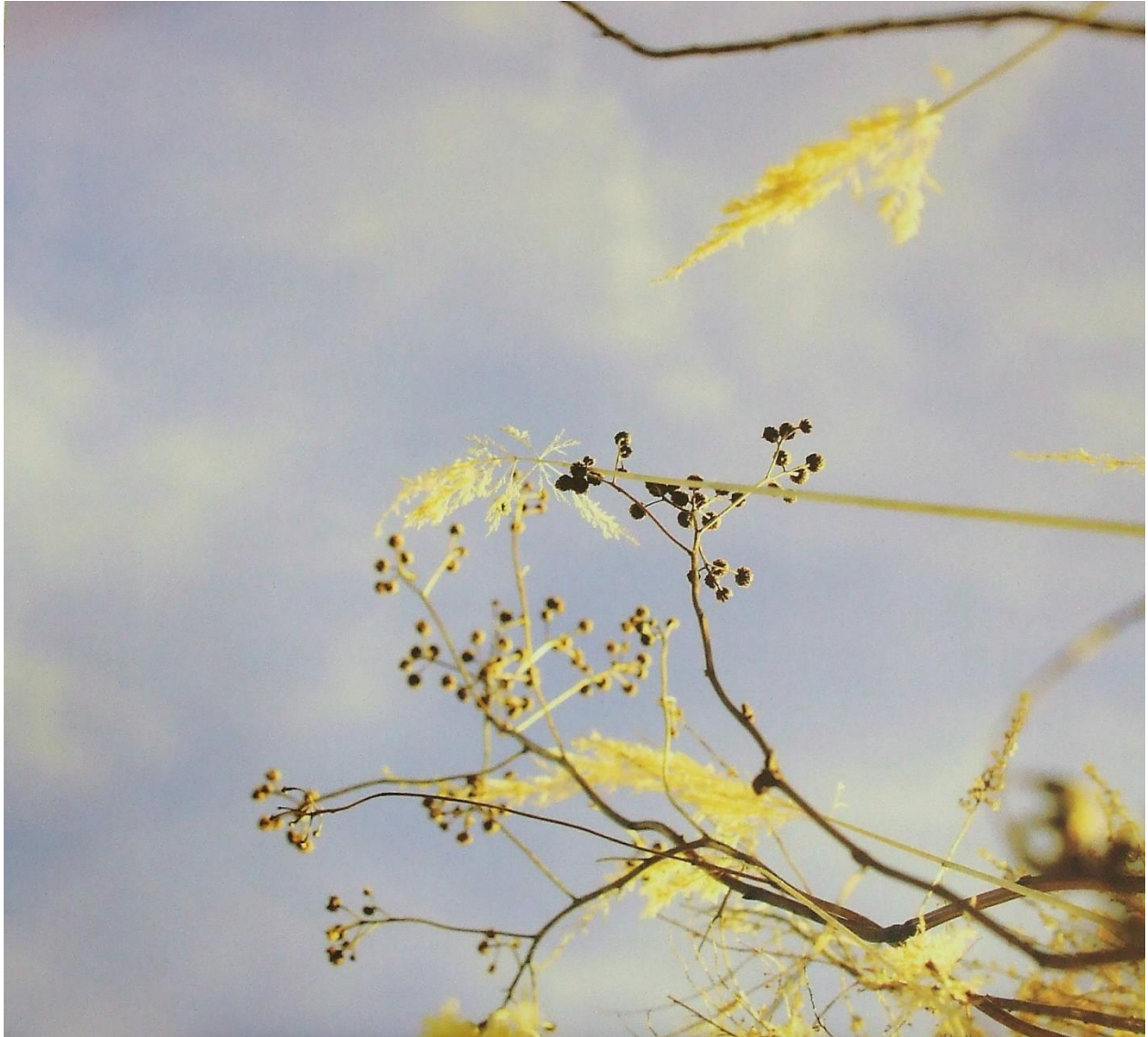
Artwork by Luca Slawick

It is an ongoing research and systematically development as any progress of creativity.